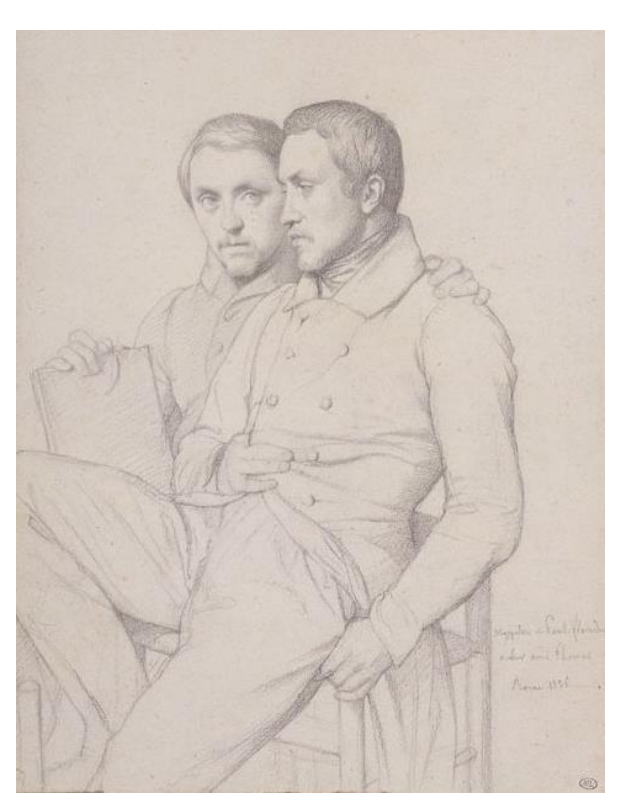
Fig. 2, Hippolyte and Paul Flandrin, Double Self-Portrait , 1835, pencil on paper, 25.4 x 19.8 cm, Musée du Louvre